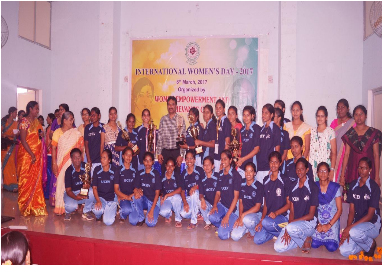
Girls receiving the Trophy for the success in the sports:" kabaddi championship"

"Victory is in having done your best .if you've done your best, you've won."