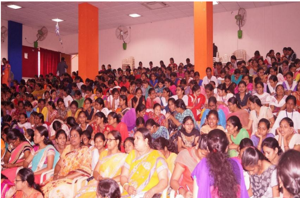
Students and faculty members attended the event.

If somebody claims that he/she is in favor of sending girls to educational institutions and he will never advocate the idea of women going out all alone independently and doing what her heart says, than to be very frank that person is not less guilty than the one who is against sending girls to schools and colleges.