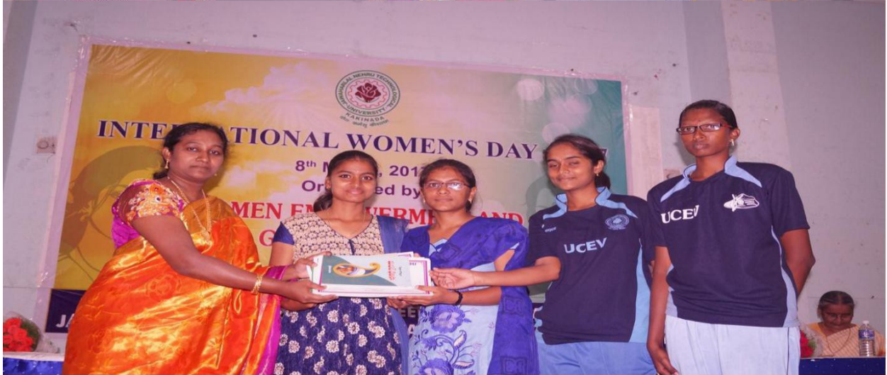
All the students receiving appreciation certificates for their achievements in different events such as Sports, Cultural, Academics.