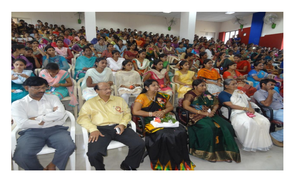
Students and faculty members attended the event.

Women empowerment is empowering the women to take their own decisions for their personal dependent. Empowering women is to make them independent in all aspects from mind, thought, rights, decisions, etc by leaving all the social and family limitations. It is to bring equality in the society for both male and female in all areas. Women empowerment is very necessary to make the bright future of the family, society and country.