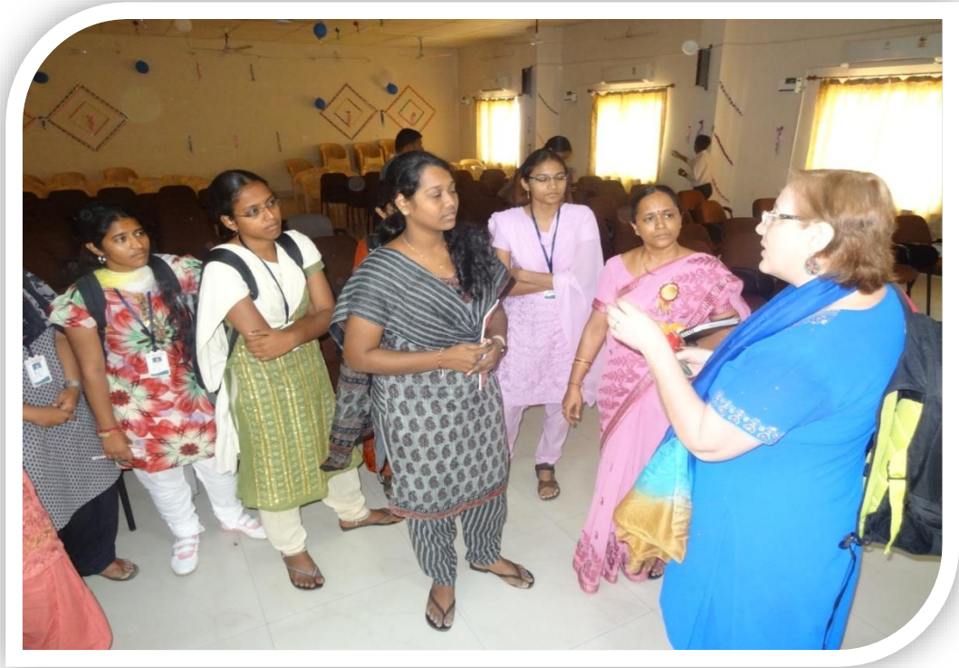
Chief Guest interacting with our students and sharing her advices

“WE ALREADY HAVE everything we need. There is no need for self-improvement. All these trips that we lay on ourselves—the heavy-duty fearing that we’re bad and hoping that we’re good, the identities that we so dearly cling to, the rage, the jealousy and the addictions of all kinds—never touch our basic wealth. They are like clouds that temporarily block the sun. But all the time our warmth and brilliance are right here. This is who we really are. We are one blink of an eye away from being fully awake.”